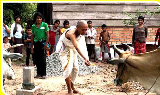
Go Puja on Purnima day